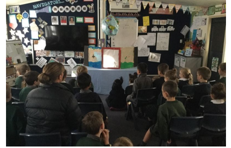
Performing our plays and puppet shows for the Junior Syndicate.