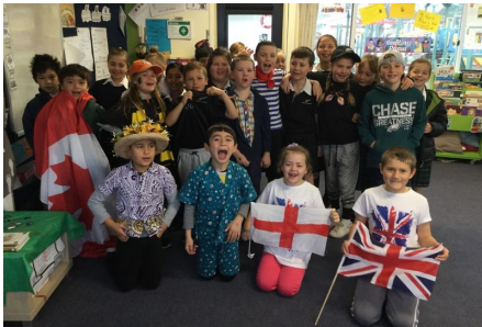
Cultural Celebration Day!