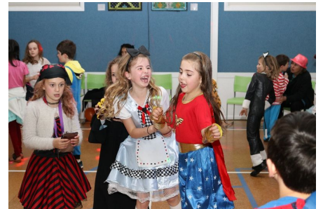
Fun at the PTF school disco.