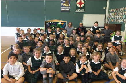
Maori Myths and Legends workshop with The Dowse Art Gallery.