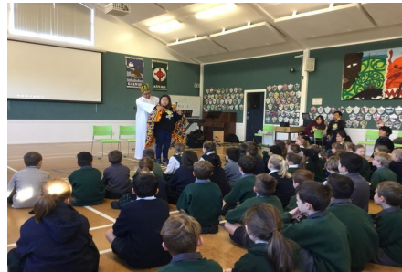
School Retreat with the ICPE Mission NZ team.